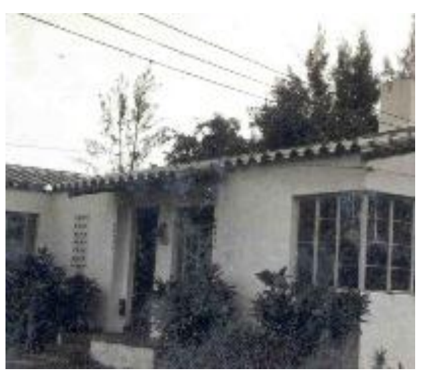
FIGURE 3.7 PROPERTY TAX CARD 432 NE 65 STREET PALM GROVE