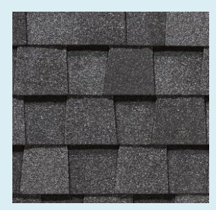
Asphalt Shingle Colonial Revival, American Foursquare, Neoclassical, Bungalow, Minimal Traditional, Ranch, Split Level, Contemporary, Miami Modern