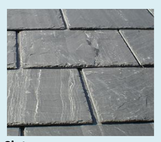
Wood Frame Vernacular, Shotgun,