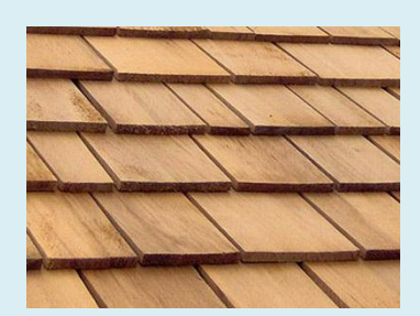
Wood Shingle Wood Frame Vernacular, Shotgun