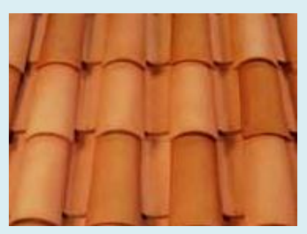
Mission or Barrel Tile (C-Shaped) Mediterranean, Spanish Revival, Miami Modern