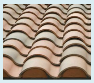
Spanish Tile (S-shaped) Mediterranean, Spanish Revival, Miami Modern