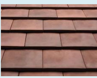
Concrete or Clay Tile Minimal Traditional, Ranch, Split Level, Contemporary, Miami Modern