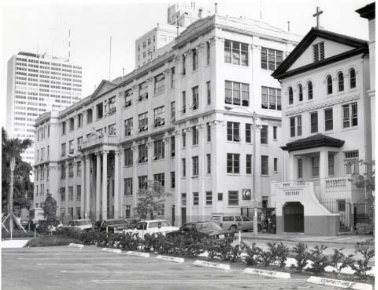
Gesu School (left) and Gesu Rectory (right) 130-170 N.E. 2 Street North facades (1982)