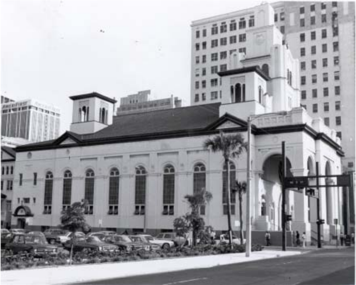
Gesu Church 118 N.E. 2 Street North and west facades 1982