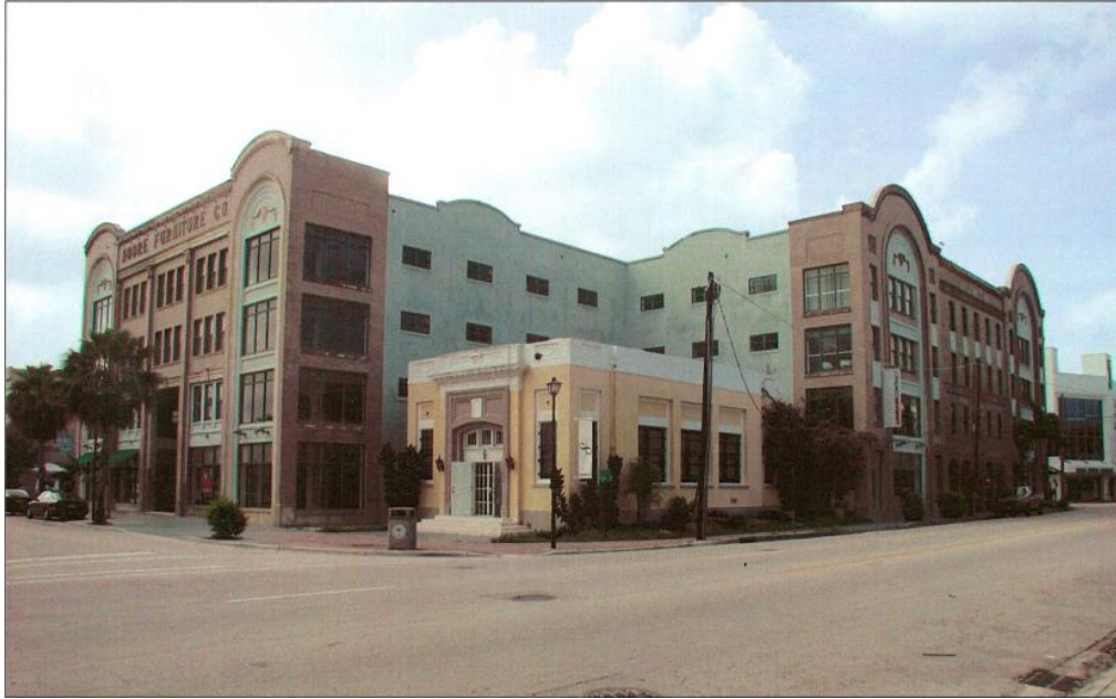
Figure 5: Moore Furniture Company

Kisa Hooks, "Buena Vista Post Office / Moore Furniture Company: Designation Report," July 2004, 14