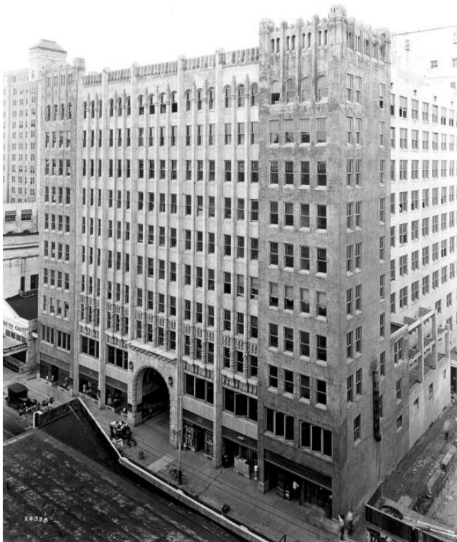
Figure 6: Seybold building

Kisa Hooks, "Buena Vista Post Office / Moore Furniture Company: Designation Report," July 2004, 14