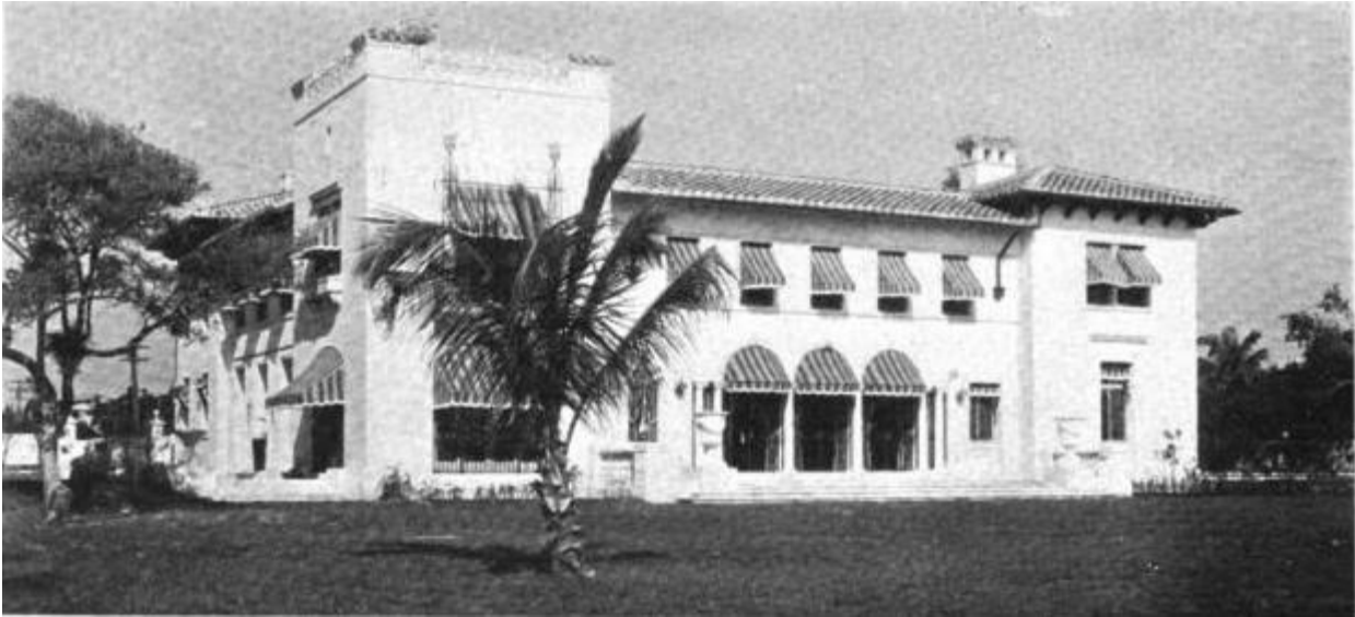
Figure 1: B.F. Tobin Residence.

Abraham D. Lavender, Miami Beach in 1920, The Making of a Winter Resort (Charleston SC, Arcadia Publishing), p.115